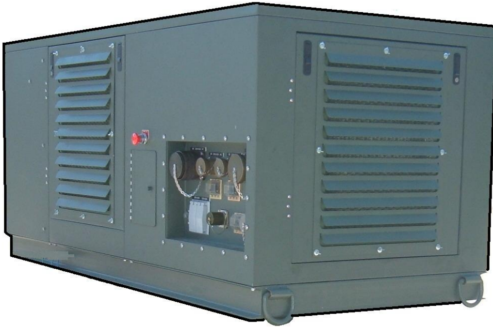
Left rear view

Engine: Kubota 3300 Turbo Generator: Marathon361PSL1600 Automatic Voltage Regulator Main Line Set Mounted Circuit Breaker 4" Steel Channel Skid-Base Vibration Isolators High-Ambient Radiator Cooled with Blower Fan, Fan Guards Dry Type Air Cleaner Spin on Lube Oil Filter, Spin on Fuel Oil Filters Critical Exhaust Silencer Stainless Steel Exhaust Flex 24-Volt Direct Current Starting Motor, 24-Volt Direct Current Battery Charging Alternator, 24 VDC Fuel Pump Safety Shutdowns for High Water Temperature and Low Oil Pressure Set Mounted Start/Stop Switch and Hour Meter Dimensions (Open): L= 64" W= 27" H= 34" Digital Engine/Generator Control Panel: AC Ammeter, AC Voltmeter, Frequency Meter, Running Time Meter, Engine Oil Pressure Gauge, Water Temperature Gauge, Line Reading Selector Switch, Off/Auto/Manual Switch, Auto Start Engine Controller With Fault Lights for Over Speed, Over Crank, Low Oil Pressure, and High Water Temperature. Dual Gel Cell Battery, with Rack and Cables