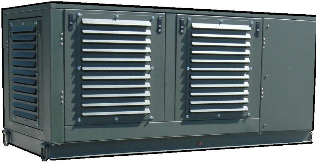
Right and rear view